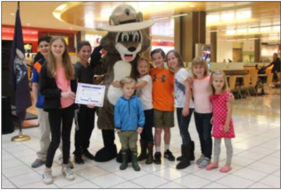
Chesterfield Green Trails Elementary youth pose with Ranger Rick at the Chesterfield Earth Day Festival.