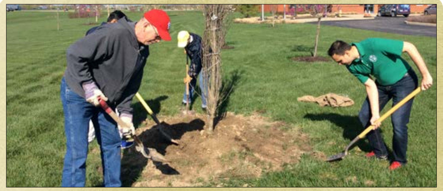
The Citizens Committee for the Environment and the Parks, Recreation & Arts Citizen Advisory Committee work together to plant native trees at the Parks Admin Building.