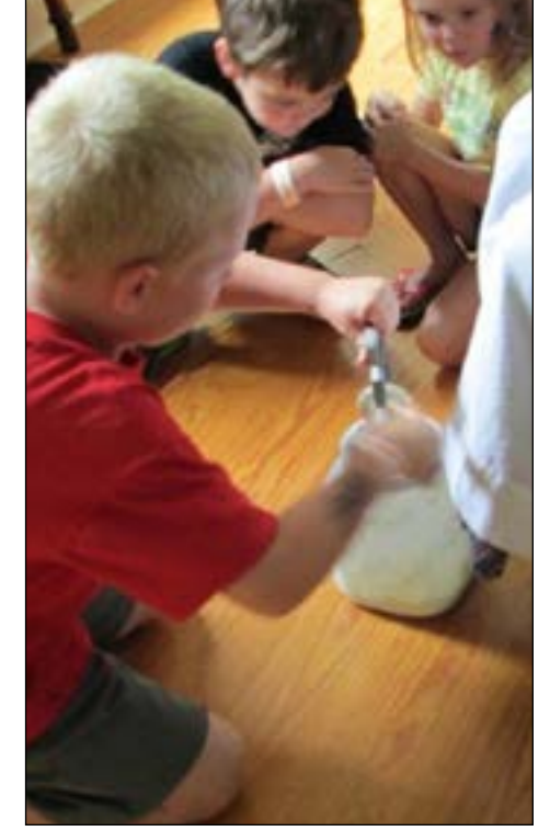
Kids learn the art of churning butter at the Olden Days of Summer in Faust Park.

Come visit the home of Missouri's second governor, Frederick Bates, to learn about his role in creating the state of Missouri. The house is partially furnished. Also on site are the original 1820s and 1860s barns, the smokehouse, ice house, peach orchard and blacksmith shop. The estate also includes the family cemetery, burial site of the governor.