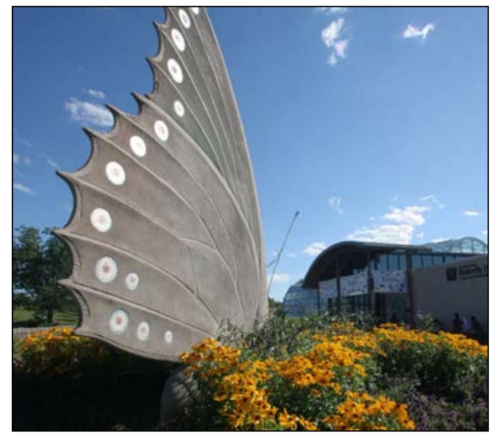
The Butterfly House is the perfect sanctuary for Yoga beginning in July.