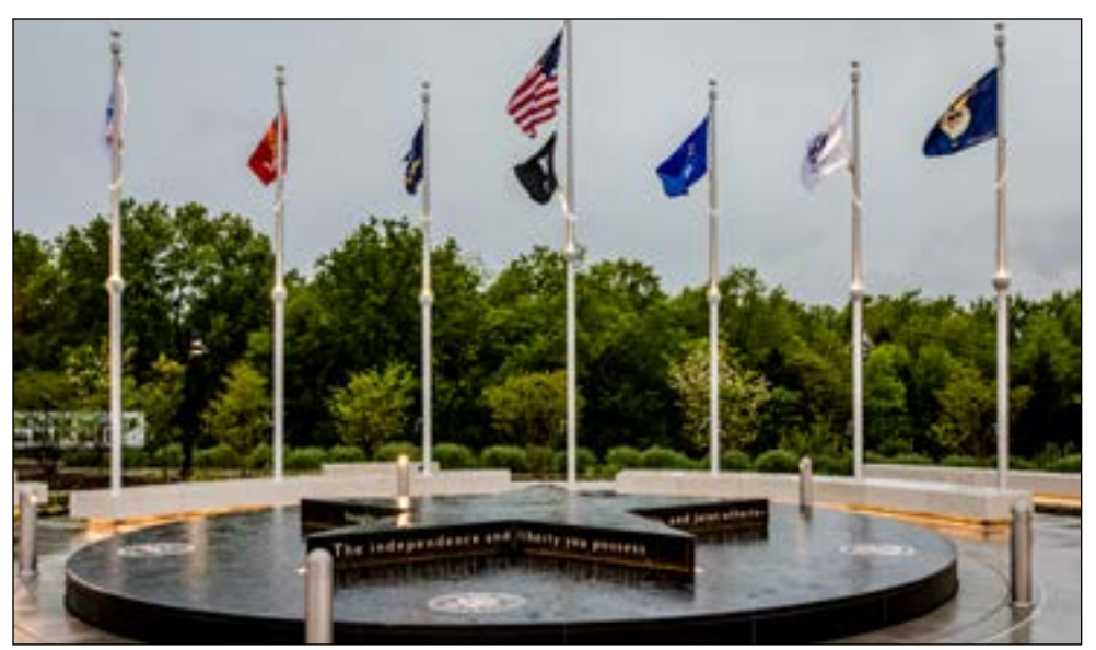
The Veterans Honor Park monument star was designed to represent the five branches of the Armed Forces.