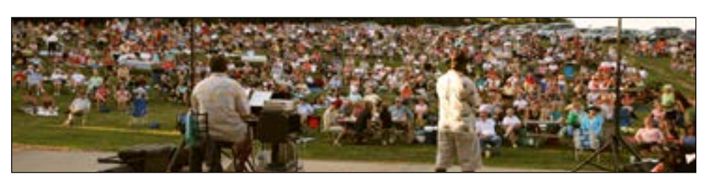
Community gathers for Chamber of Commerce free concert series.

CAPY's annual Back to School Pool Party is set for August 25 from 7:45 to 10:30 p.m. at the Chesterfield Family Aquatic Center. This party is open to all Chesterfield-area middle school students. Parents are also welcome to stay and enjoy watching the kids have fun. Pizza, soda, water and cookies are provided at no charge. The event will feature games that will help kids learn about the negative effects of substance abuse. The event is also meant to showcase to the kids that a good time may be had without the use of mood-altering substances. Educational literature concerning substance abuse issues will also be available for parents. CAPY is the Chesterfield Alliance for Positive Youth, the mission of which is to promote healthy, safe and substance-free choices for the youth of Chesterfield.