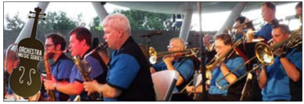
Gateway City Big Band performing at the Chesterfield Amphitheater in 2015.