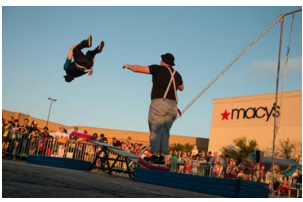
Circus Kaput returns to the 4th of July event this year with thrilling acrobatics and more.

summer. Three performance stages will bring the park back to life with national and local DJs, bands, arts and more! Adding another dimension to the event will be a colossal amount of temporary art installations both big and small, dotting the landscape and transporting the festival-goer's mind into a parallel universe called The 'Burbs. The St. Louis Post Dispatch will host a VIP Preview night of the 'Burbs, Sip n' See on Friday, August 4. This 21+ event will feature a wine tasting from area wineries and local restaurants, live music, and a sneak peak of the art installations prior to Saturday's festival – including a list to GO! Magazine's Rising Star and local artists. For a full concert line-up and more event details, visit burbsfest.com.